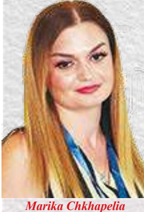
Educationist Zugdidi - Georgia

May the coming years continue to bring innovation and transformative contributions to the field of education. I wish Education Jagat a happy anniversary and many years of publication