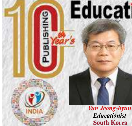
Education Jagat 16 > 31 March 2025

Education Jagat There is a difference in daily life between those who start their day with positive thoughts